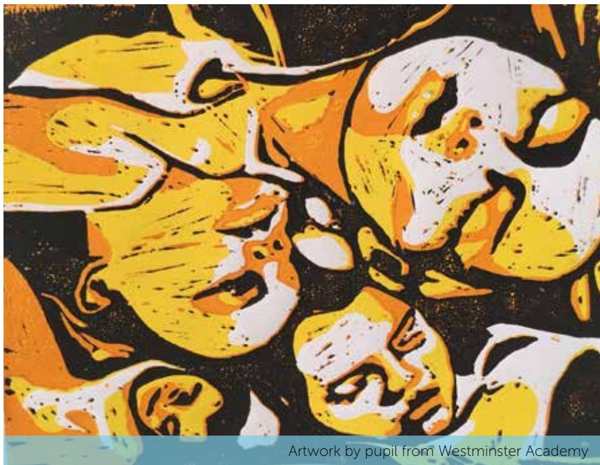
Artwork by pupil from Westminster Academy

Banding test: Saturday 9th December, 9.30 – 11am