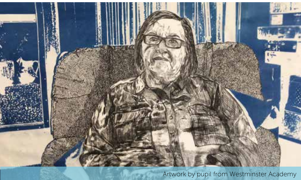
Artwork by pupil from Westminster Academy

You also have the right of appeal to an Independent Appeal Panel against the decision not to offer your child a place at your preferred school(s).