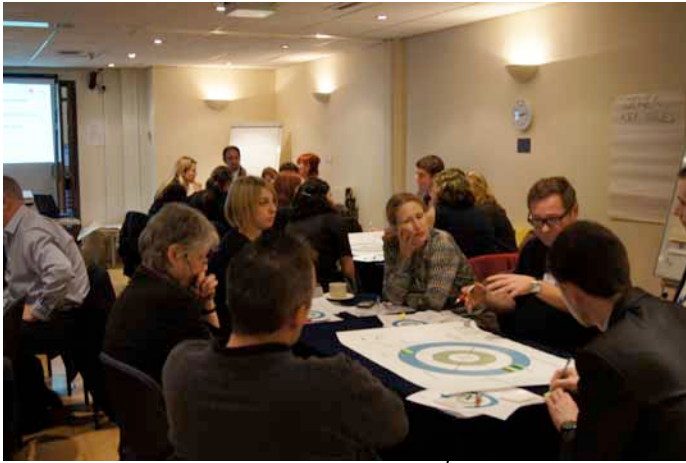
Figure 1: Stakeholder event 21 st November (2012)