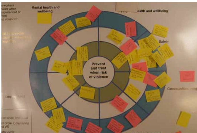
Figure 2: Use of the Stakeholder Engagement wheel at the Stakeholder Event