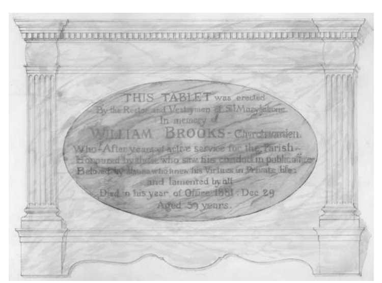
Watercolour of memorial tablet in St Marylebone church