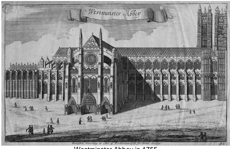
Westminster Abbey in 1755

WCA has Baptism Registers 1838-1853 the rest are at LMA