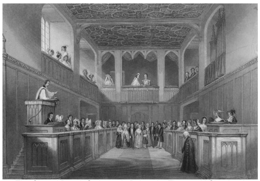
The Chapel Royal, St James's Palace by Thomas H Shepherd

For further information, contact Royal Household Enquiries on 020-7930 4832 or the National Archives at Kew (formerly the Public Record Office).