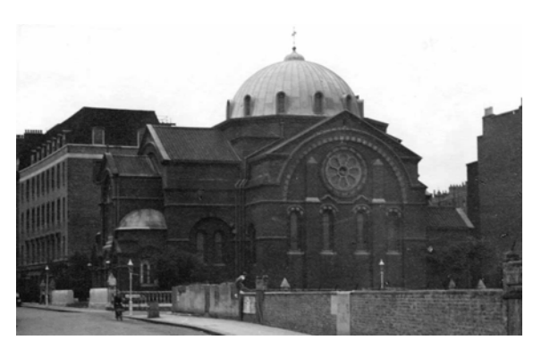
The Greek Orthodox Cathedral of St Sophia, Moscow Road

The two orthodox cathedrals in London are: