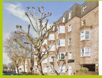
Ernest Harris House 61 Elain Avenue North Paddington W9 2BX

The first co-design workshops ran on 19 February and will continue until 22 April.