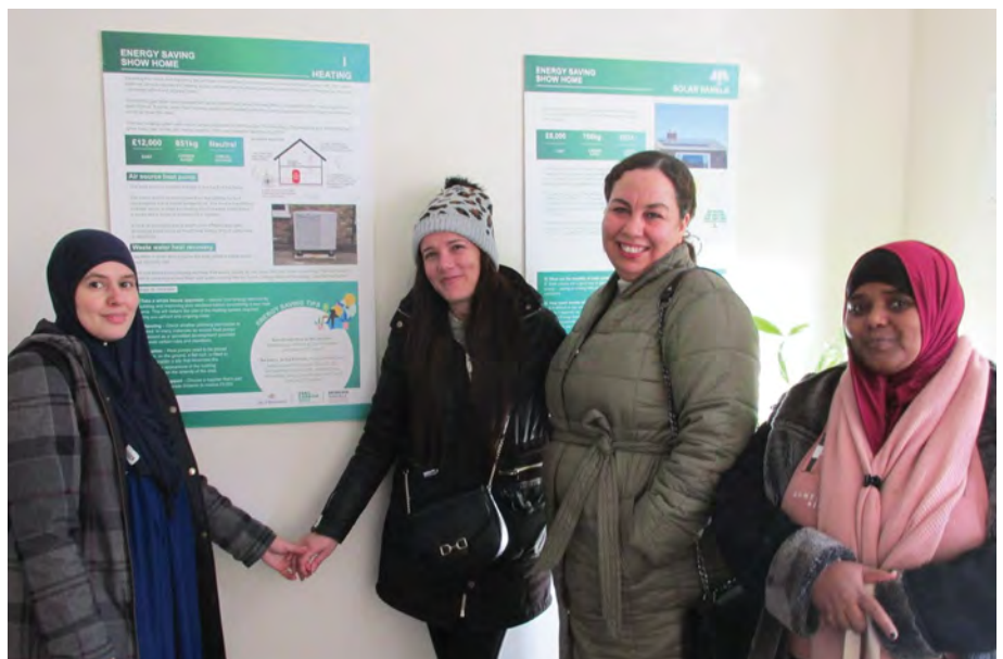
Students visit to retrofitted building with low carbon technology

To find out more about the project contact adunkleywaesac.uk or call 020 3988 7666.