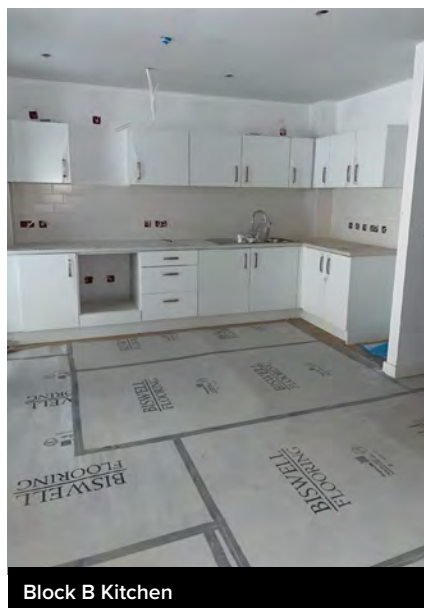
Block B Kitchen