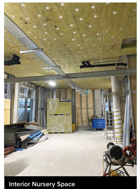
Interior Nursery Space