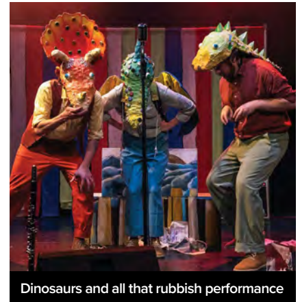
Dinosaurs and all that rubbish performance