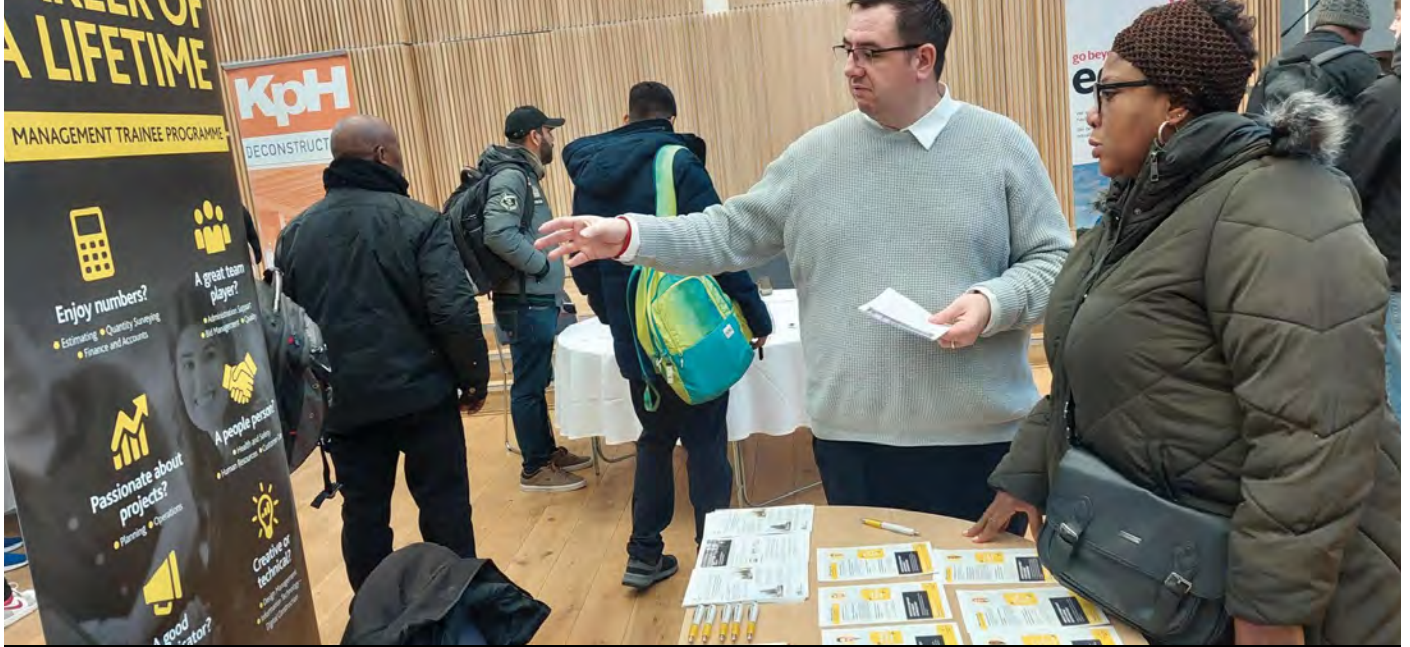
Construction Careers Fair held at Westbourne Park Baptist Church