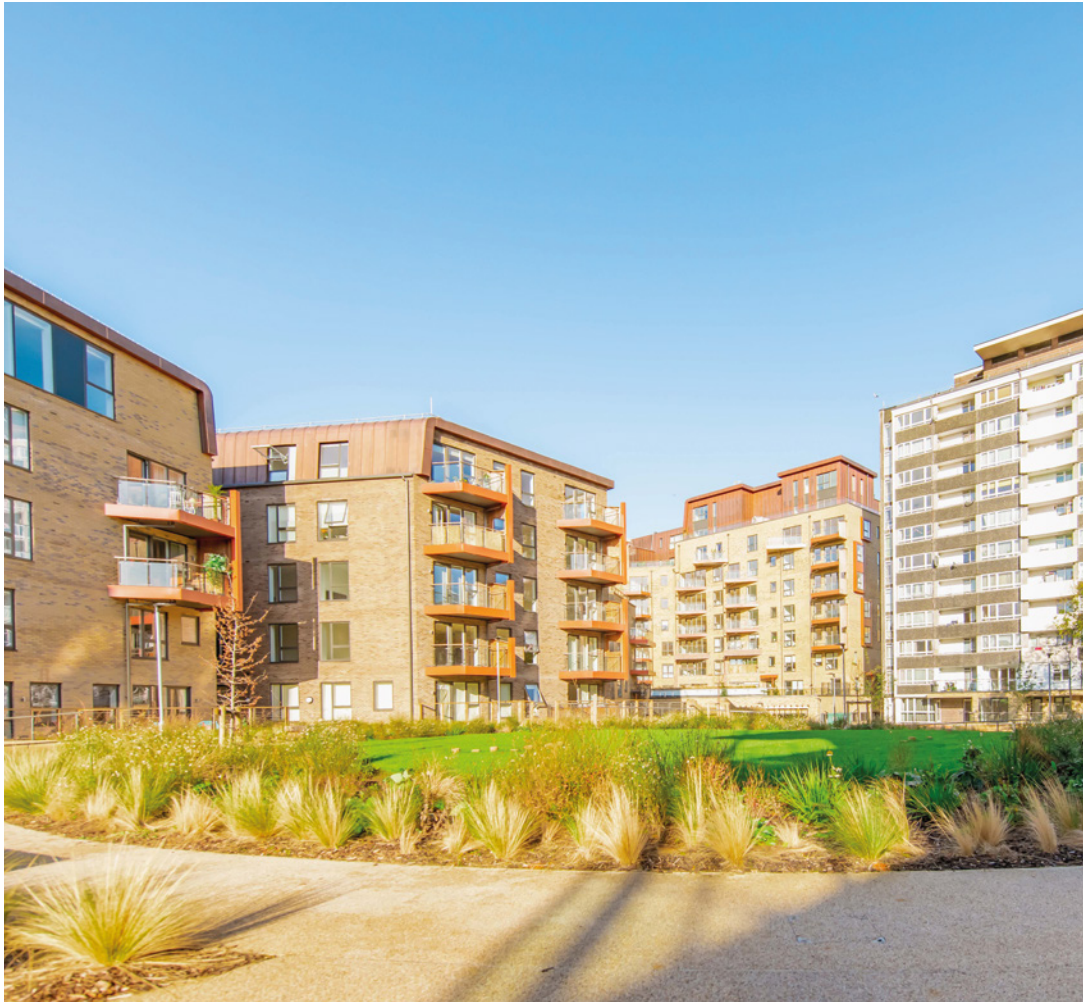
A sunny day in Tollgate Gardens