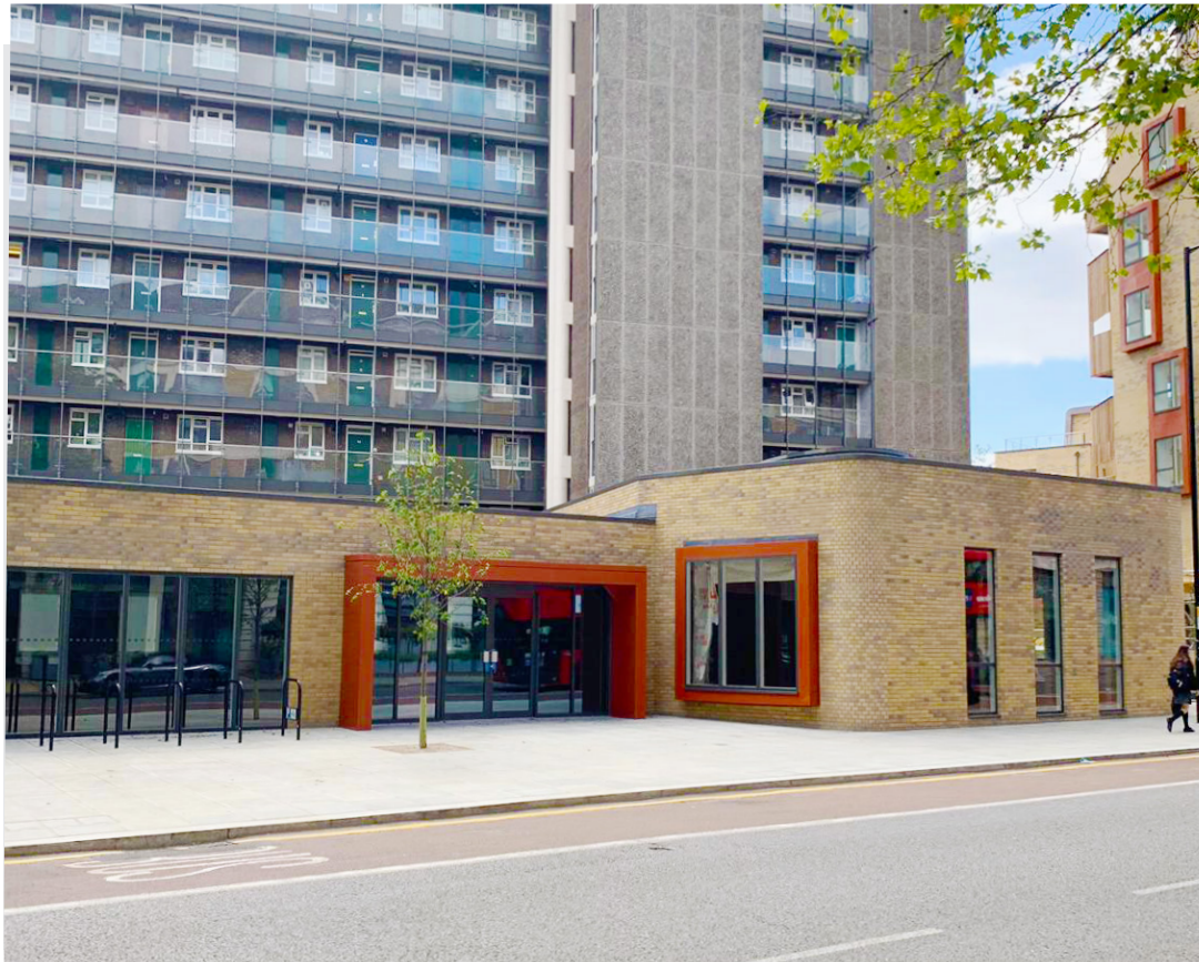
View of Tollgate House from Kilburn High Road