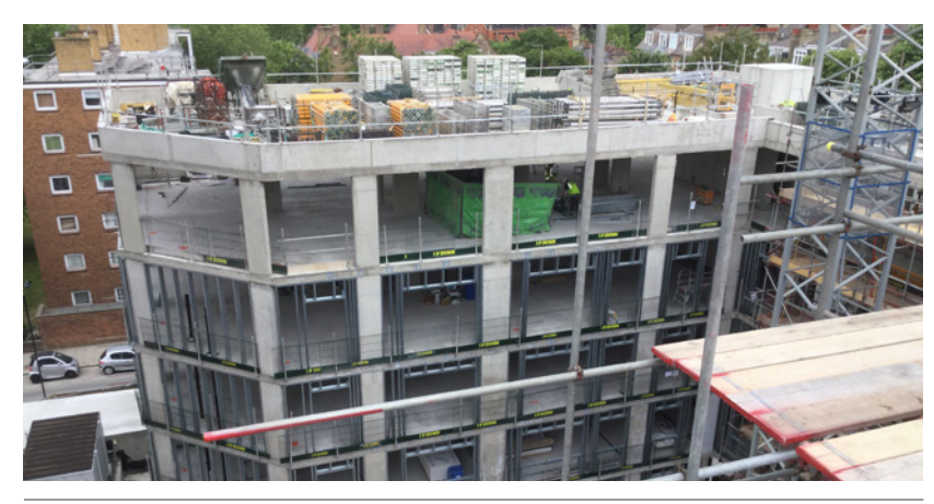
The site in June 2020, as the development reached it's highest point