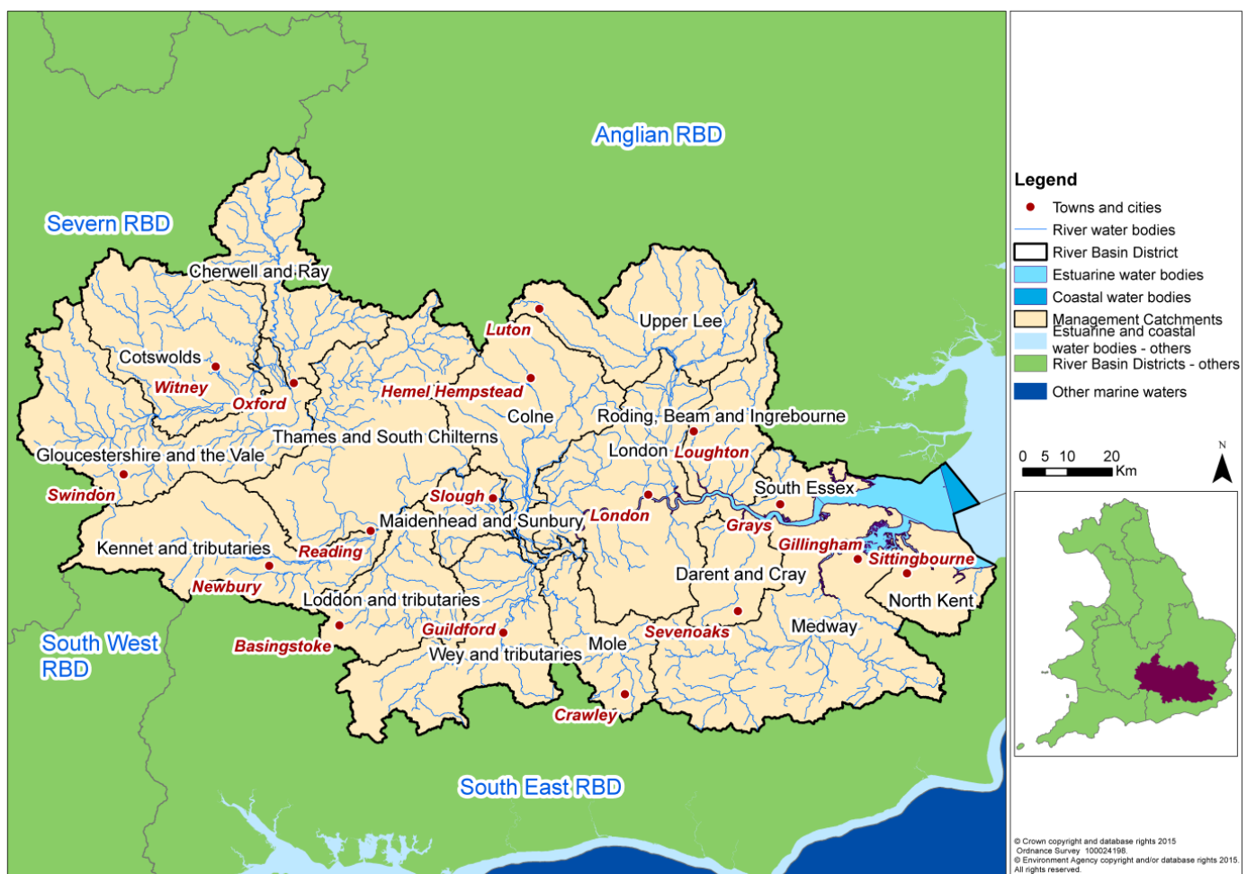
Figure 2: Management catchments within the Thames river basin district

Each catchment partnership is committed to working collaboratively to share evidence, develop common priorities and carry out work on the ground. Many partnerships are producing catchment plans that will detail local actions related to the measures in this plan. Partnerships are at different levels of maturity, so while some may have a detailed plan for measures in their catchment, others may be newly formed and may not have such a detailed view at this stage.