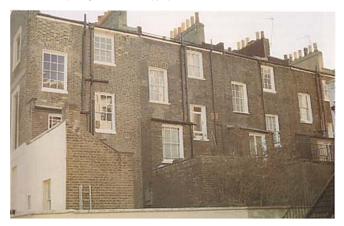
A degree of uniformity at the rear of a terrace. The line of the eaves gutter is uninterrupted by any extensions or alterations.

I.6 The detailed design and materials used should normally reflect those of the main building e.g. on an eighteenth or nineteenth century terrace of domestic buildings, a brick built extension with traditional sash windows within arched openings, will often be appropriate.