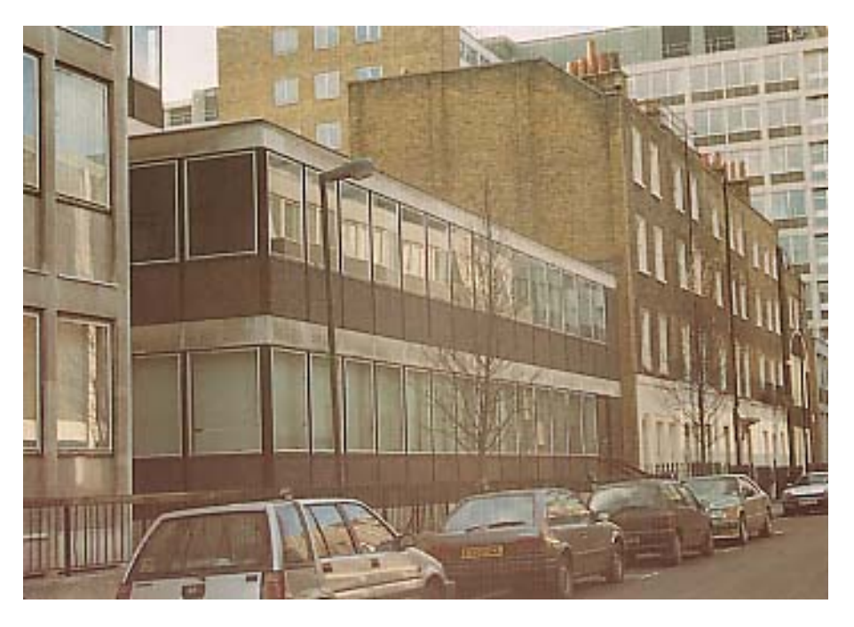
Robert Adam Street, W1. This 1960s redevelopment fails to pay regard to the adjacent Georgian terraced houses which play such an important role in defining the character of the Portman Estate Conservation Area.

E.8 Where a building makes a positive contribution to the conservation area there is a general presumption in favour of its retention (see over).