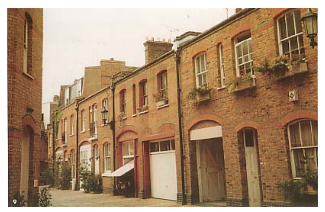
Relton Mews, SW7. An article 4 direction means that planning permission is required for the painting of the brickwork of the front facades. Such painting would adversely affect the appearance of the mews and the Knightsbridge Conservation Area of which it is an important part.

subject to an article 4 direction and it would then be necessary to obtain planning permission for such work.