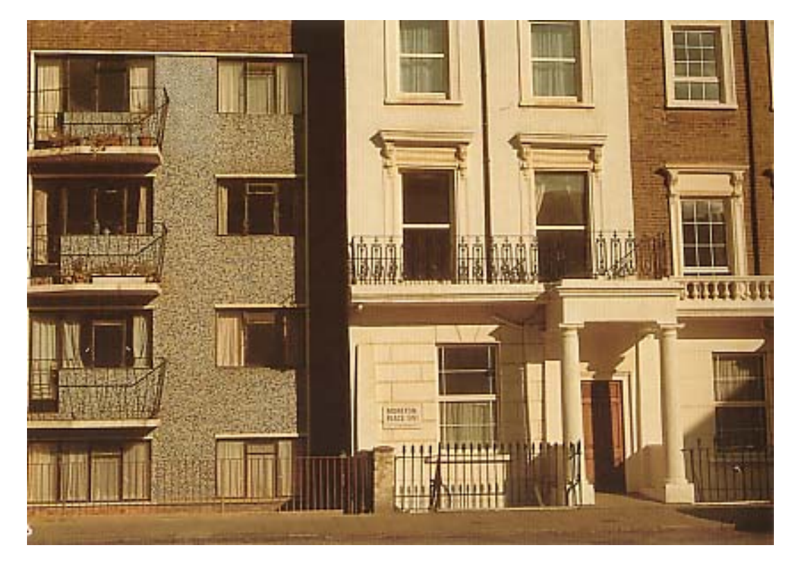
The stuccoed building on the right is typical of the Pimlico Conservation Area and there is a strong presumption in favour of its retention. The same could not be said of the building on the left.

if a public building, does its use and internal public spaces contribute to the character or appearance of the conservation area?