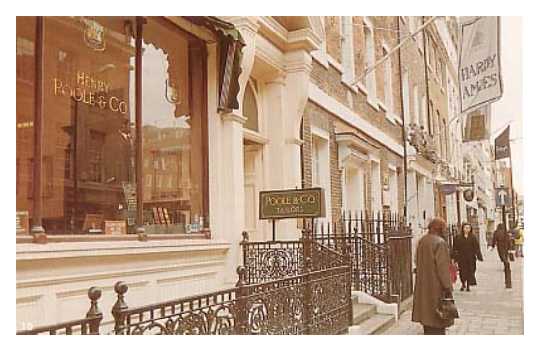
Savile Row, W1. This street has an international reputation for tailoring. This cluster of clothing businesses contributes to the character of the Mayfair Conservation Area.

D.4 Applications for change of use will also be assessed in terms of the other relevant policies, with respect to residential, office, industrial, retail uses etc., set out in the UDP.