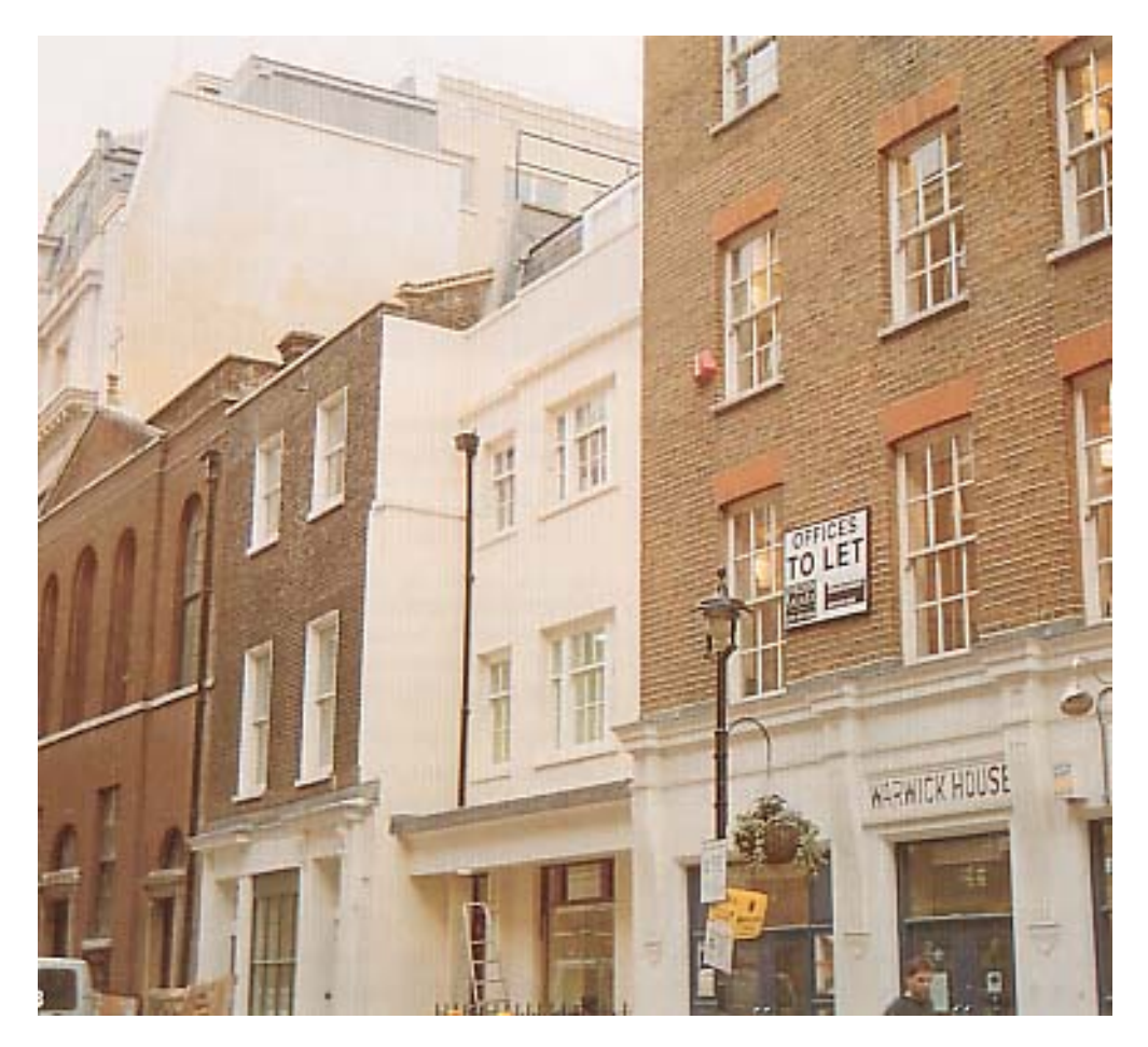
10-11 Warwick Street, W1. The City Council resisted proposals for demolition and redevelopment, arguing, at appeal, that the buildings should be saved and rehabilitated. The appeal was dismissed and the buildings have been restored.