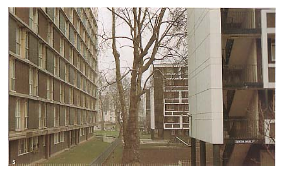
Hallfield Estate Conservation Area