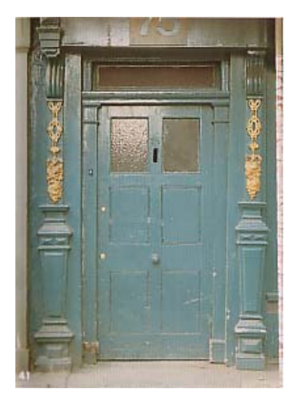
Traditional joinery should be preserved insitu and repaired where necessary.

K.3 If double glazing is desired then internal secondary glazing behind the existing windows can be used without adversely affecting the external appearance of a building. On an unlisted building planning permission would not normally be required for this work. On listed buildings, listed building consent may be necessary.