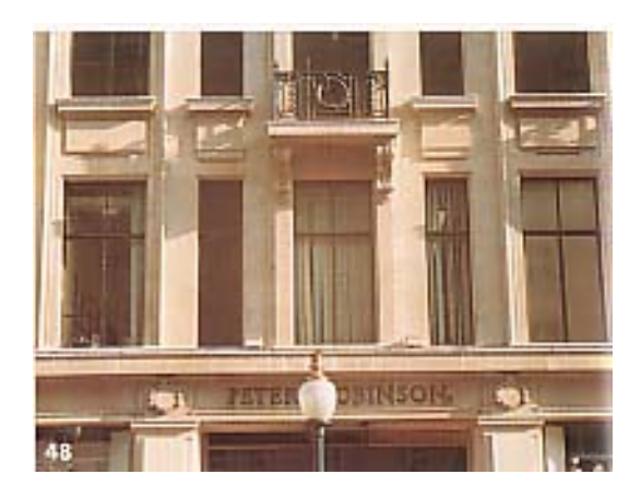
Floodlights should have minimal impact upon the external appearance of buildings through careful choice of fittings, wiring, location and colours of finishes.

L.6 Guidance on the illumination of buildings and security cameras can be found in: Lighting Up the City - A good practice guide for the illumination of buildings and monuments (1994).