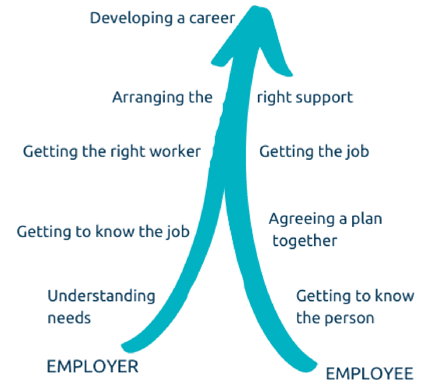
The Supported Employment Model