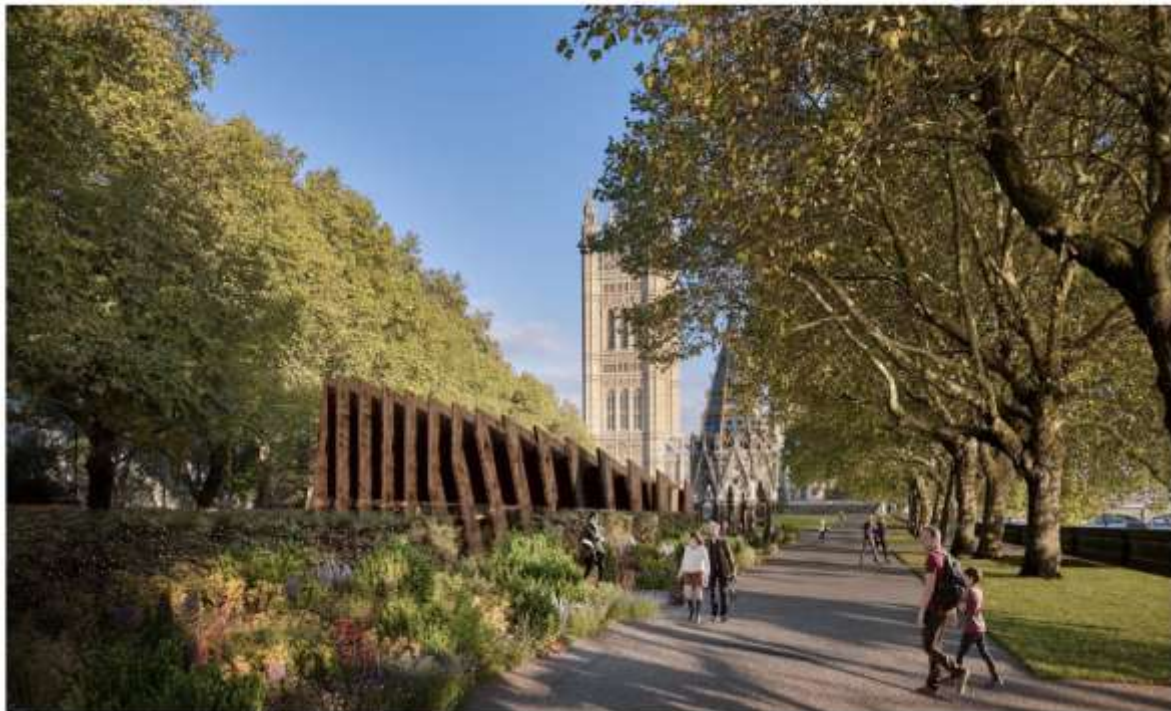
Figure 3-1 - The 23 proposed bronze-clad concrete 'fins'

The Memorial itself will comprise of 23 bronze-clad concrete 'fins', set vertically into the ground on a curving alignment. The highest point of the Memorial will be approximately 10m above the existing ground level, as illustrated in Figure 3-1 and Figure 3-2 below.