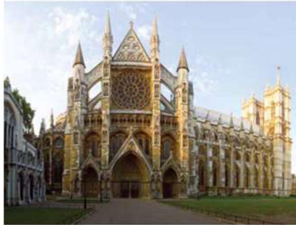
2 - Westminster Abbey