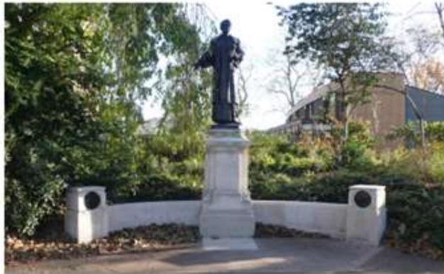
View 1 • Towards Emmeline Pankhurst Memorial