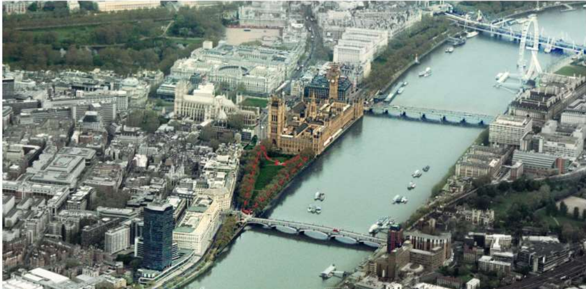
Figure 1-1 - An aerial view of Victoria Tower Gardens.

Following an international design competition, Adjaye Associates, Ron Arad Architects and Gustafson Porter + Bowman were awarded the winning concept design, which has been further developed by the design team in consultation with key stakeholders. Figure 1-2 shows the design submitted as part of the planning application in December 2018 and Figure 1-2 shows the updated version from April 2019.