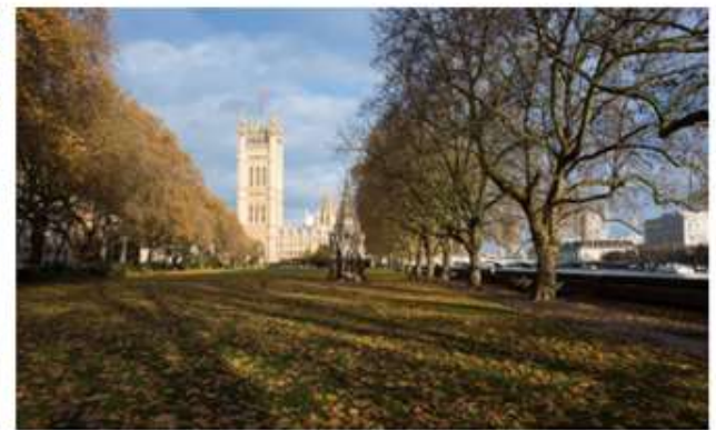
View 6 • Victoria Tower Gardens space towards Parliament