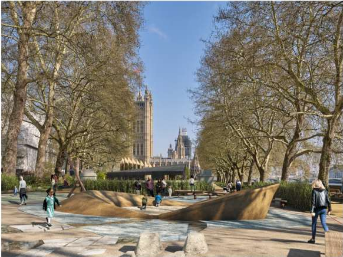
Figure 3-2 – Proposed view of the Scheme with Westminster in the background

Within the area encompassed by the curvature of the fins, the flat parkland will be re-landscaped to form a grassed slope that subtly rises, as shown in Figure 3-3. As a result, only the tips of the fins are visible from the northern portion of the Gardens.