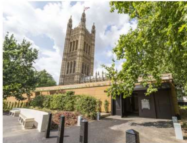
5 - Parliamentary Education Centre