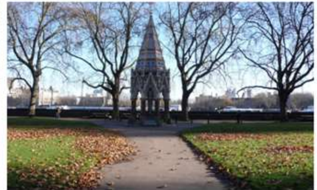
View 3 • Towards Buxton Memorial