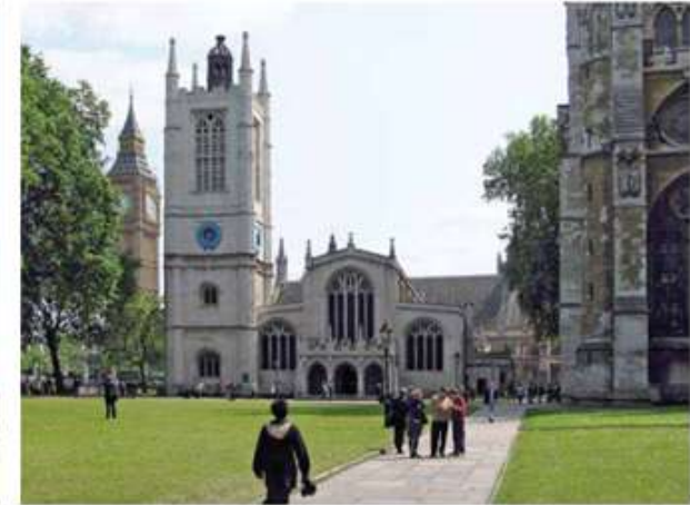
3 - St. Margaret's Church