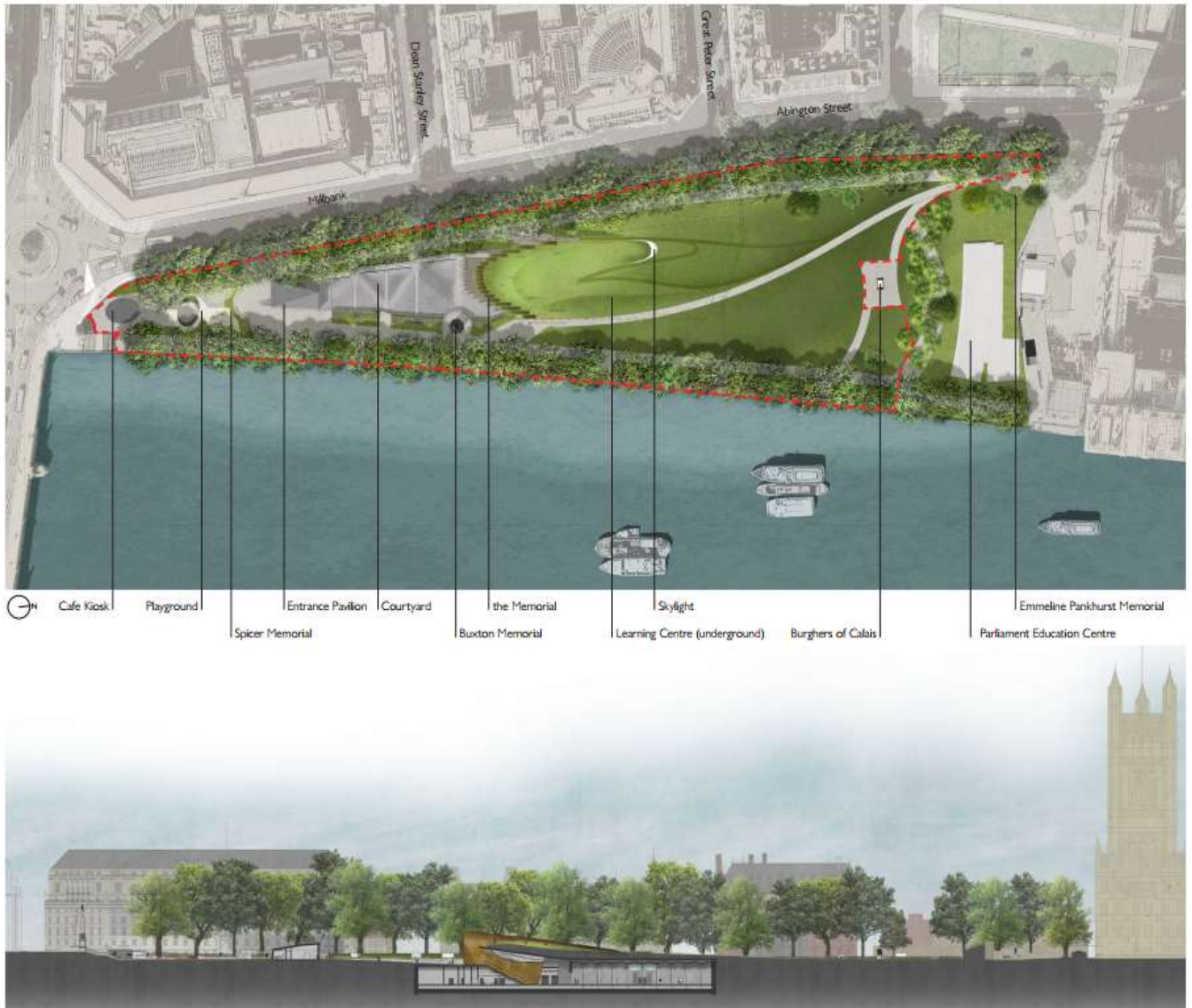
Figure 1-2 - Planning Application December 2018 (dotted red line indicates planning application Scheme boundary)