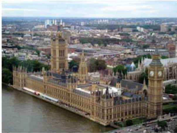
1 - Westminster Palace