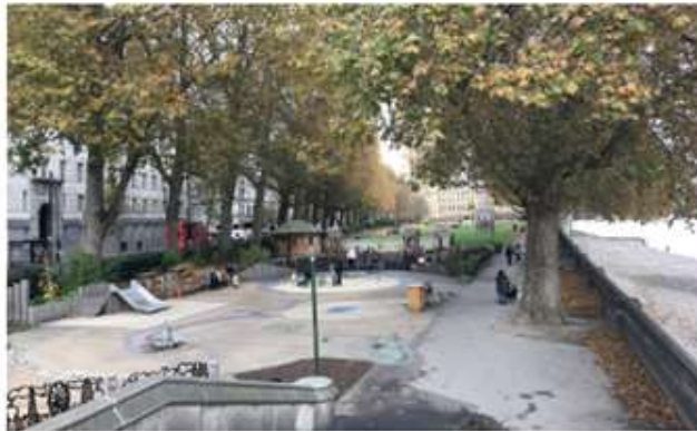
View 4 • Towards Horseferry Playground