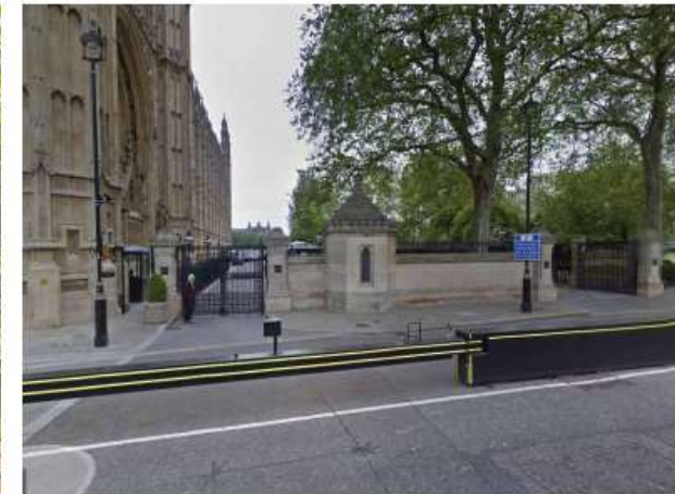
6 - Victoria Tower Lodge and gates to Black Rod's Garden