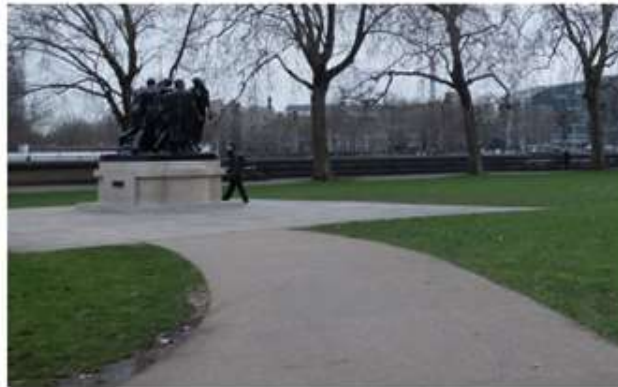
View 2 • Towards Burghers of Calais Memorial