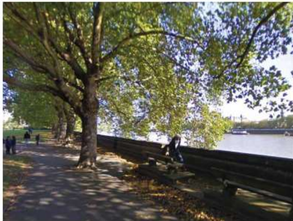
4 - Embankment