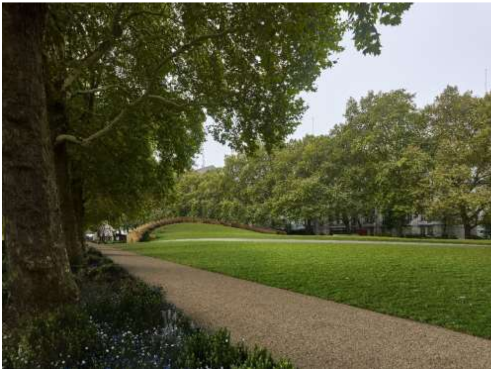
Figure 3-3 - View of the sloping grassland looking South

Within the area encompassed by the curvature of the fins, the flat parkland will be re-landscaped to form a grassed slope that subtly rises, as shown in Figure 3-3. As a result, only the tips of the fins are visible from the northern portion of the Gardens.