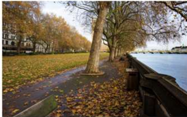
View 5 • Towards North along the riverbank