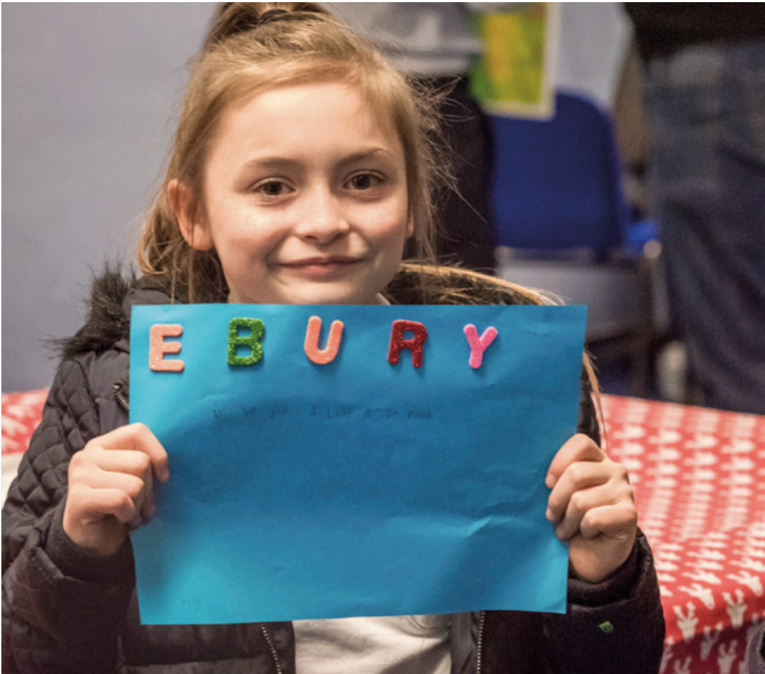
Looking towards the future of the Ebury Bridge Estate