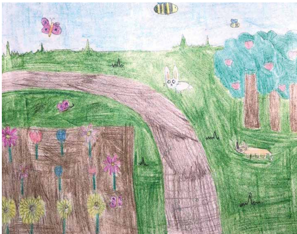
Image Artwork by pupil from Churchill Gardens Primary School

For further advice you can speak to the Admissions Team or the school (if a church school), who will be able to offer you guidance on the likelihood of your child being offered a place based on the information you provide. It is not possible to give any guarantee of the outcome of your application.