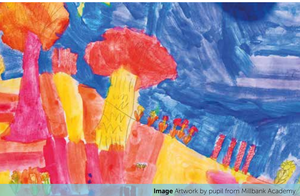
Image Artwork by pupil from Millbank Academy

after all of those which were submitted on time. This will greatly affect your chances of being offered the school you want.