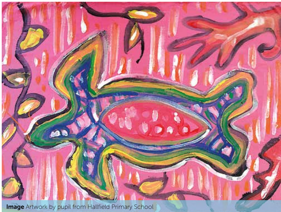
Image Artwork by pupil from Hallfield Primary School