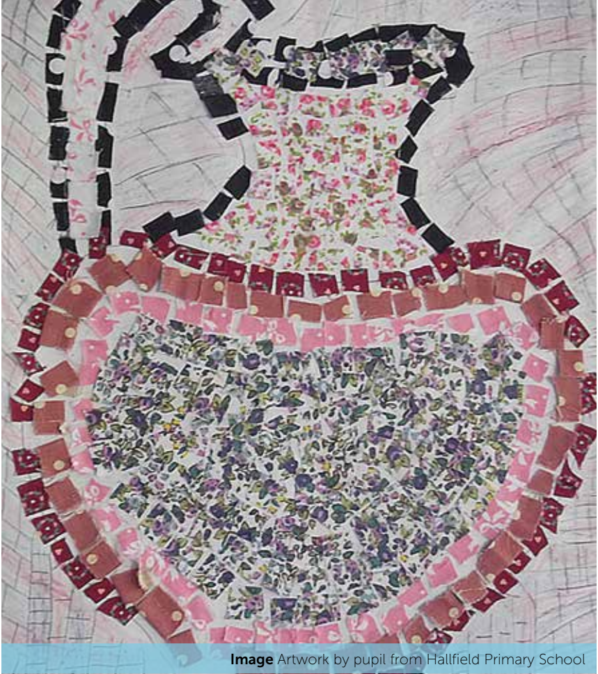
Image Artwork by pupil from Hallfield Primary School