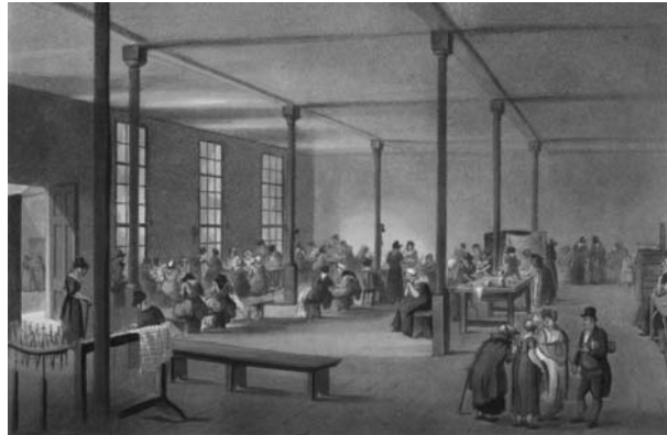
St James's Workhouse