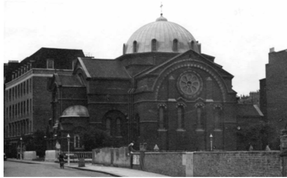
The Greek Orthodox Cathedral of St Sophia, Moscow Road

The two orthodox cathedrals in London are: