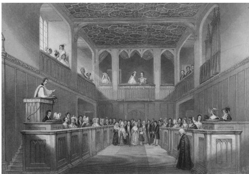
The Chapel Royal, St James's Palace by Thomas H Shepherd

For further information, contact Royal Household Enquiries on 020-7930 4832 or the National Archives at Kew (formerly the Public Record Office).