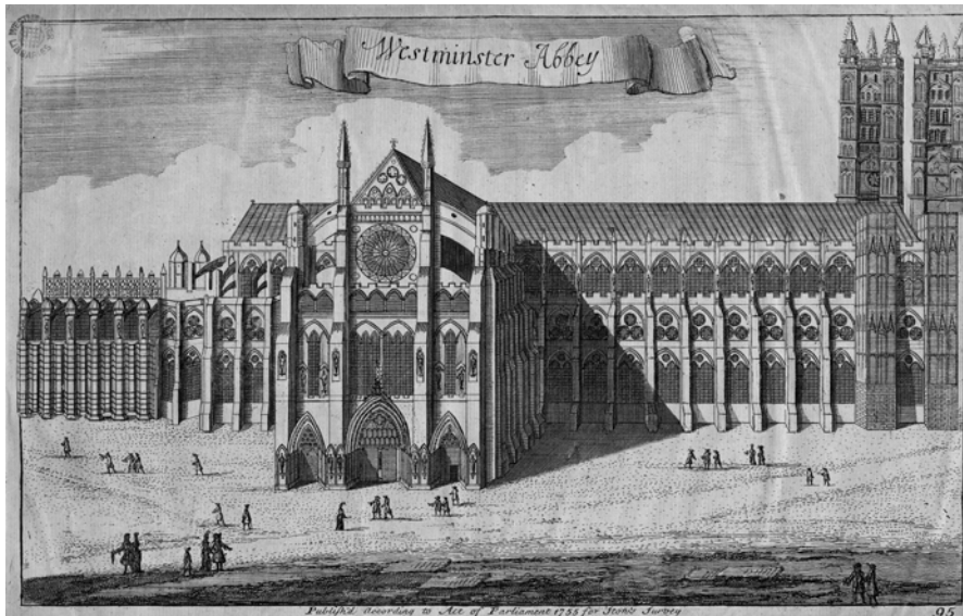
Westminster Abbey in 1755

WCA has Baptism Registers 1838-1853 the rest are at LMA