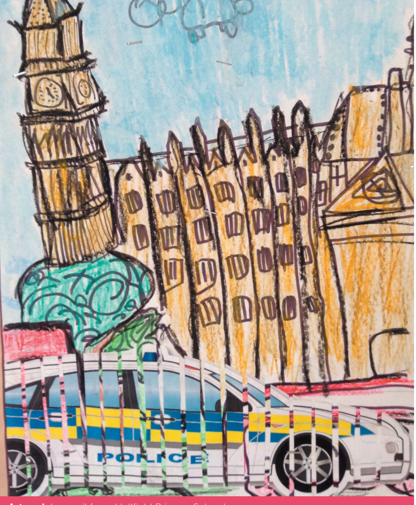
Artwork by pupil from Hallfield Primary School