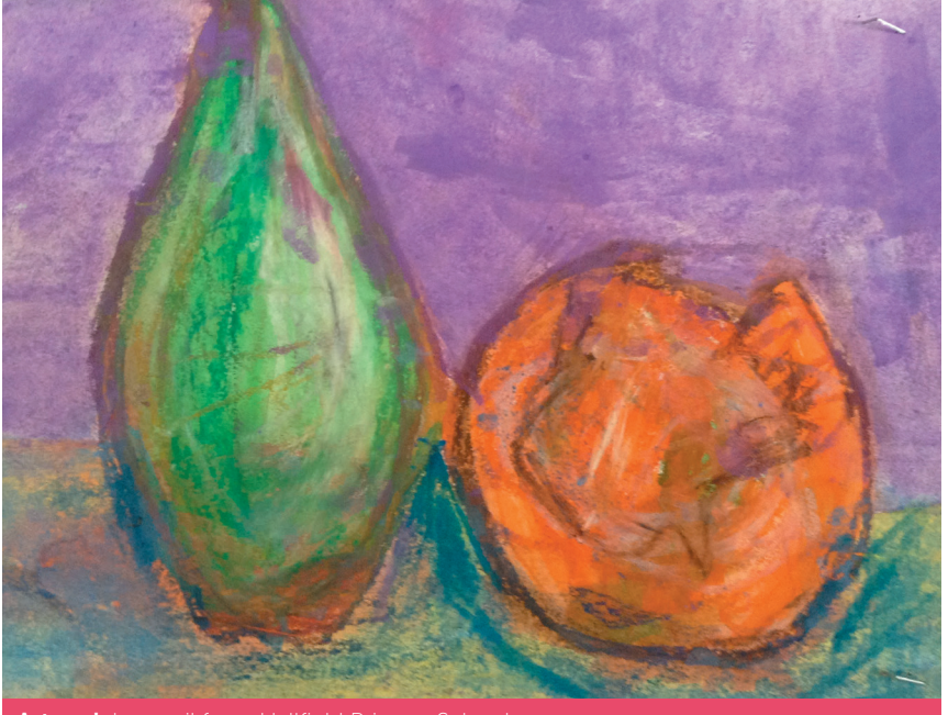
Artwork by pupil from Hallfield Primary School

application will be considered after all of those which were submitted on time. This will greatly affect your chances of being offered the school you want.