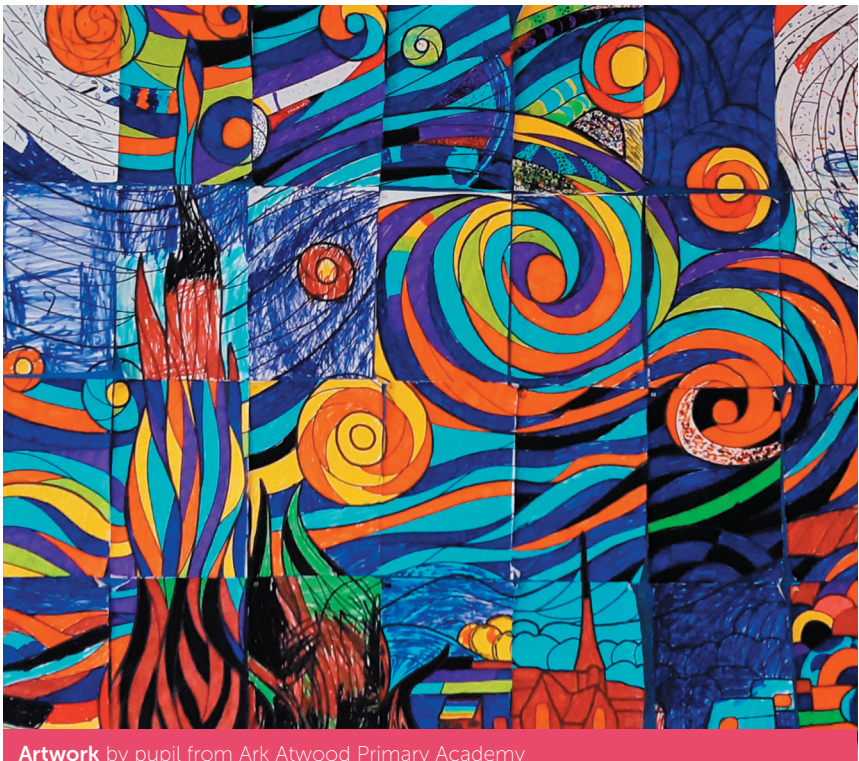
Artwork by pupil from Ark Atwood Primary Academy