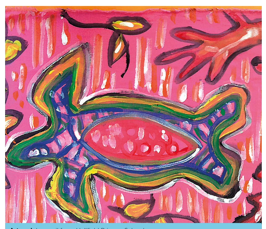
Artwork by pupil from Hallfield Primary School