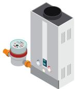
Replacing the gas boiler with an energy-efficient air source heat pump and new radiators

Changing the gas cooker to an electric hob, eliminating gas use at the property