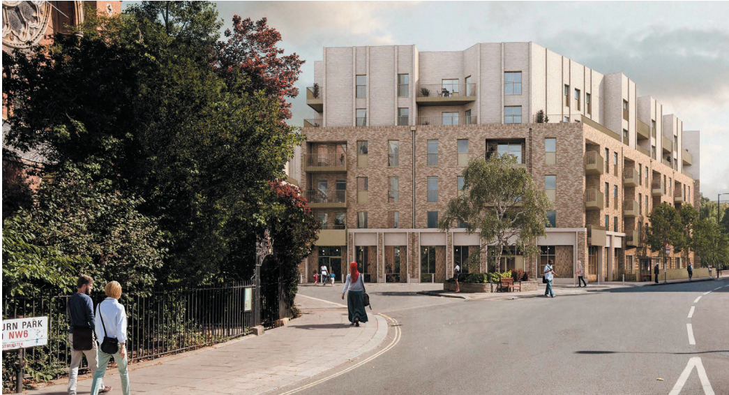
CGI image of Carlton Dene and Peebles House scheme

BRINGING YOU THE LATEST ON PLANS FOR CARLTON DENE AND PEEBLES HOUSE