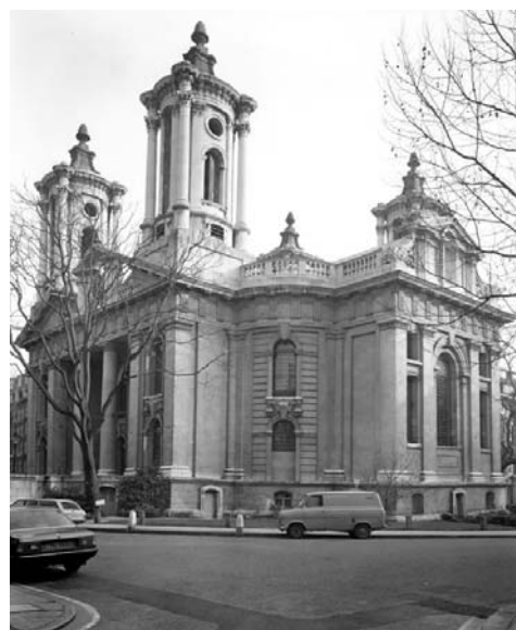
St John the Evangelist, Smith Square