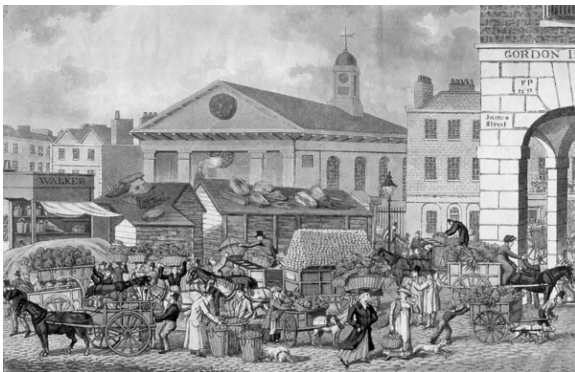
St Paul's Church, with Covent Garden Market

Baptisms 1861-1907 Mf Marriages 1864-1910 Mf