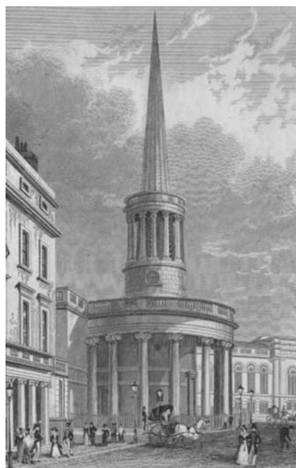
All Souls, Langham Place