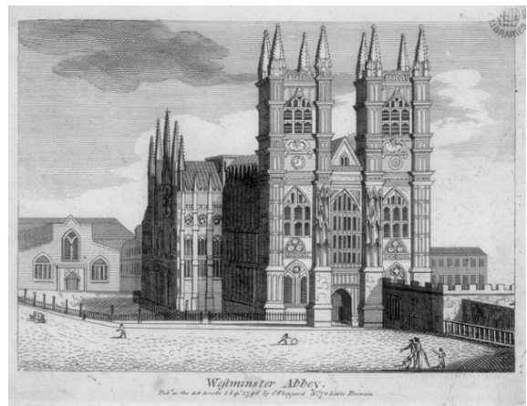
Westminster Abbey in 1796

Baptisms 1629-1883 P Marriages 1628-1760 P Burials 1629-1853 P Burials 1689-1709 P