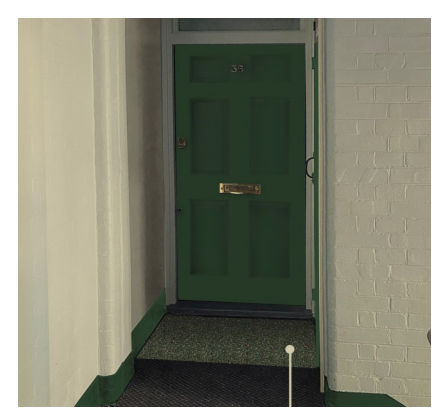
Option 1: Green

Please would you be kind enough to complete the form and return this in the pre paid envelope provided. The winning colour combination for each building will be displayed by way of a poster in your block. Please see below colour choices.