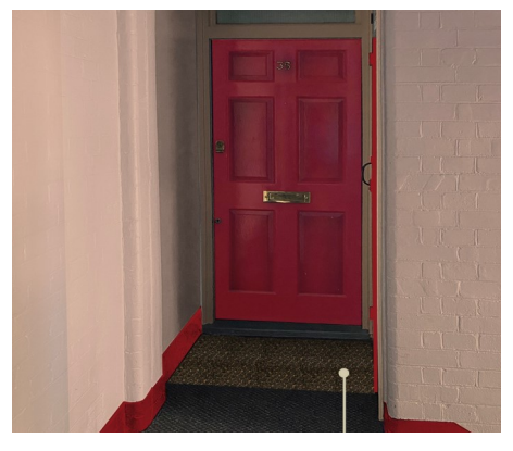
Option 2: Red