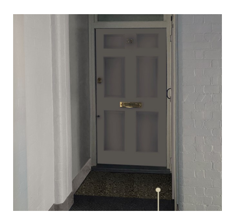
Option 3: Grey