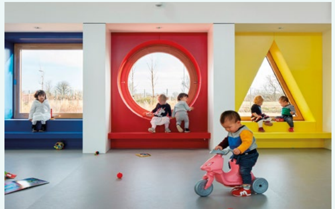
A previous nursery delivered by the architects of the 300 Harrow Road project, CGL