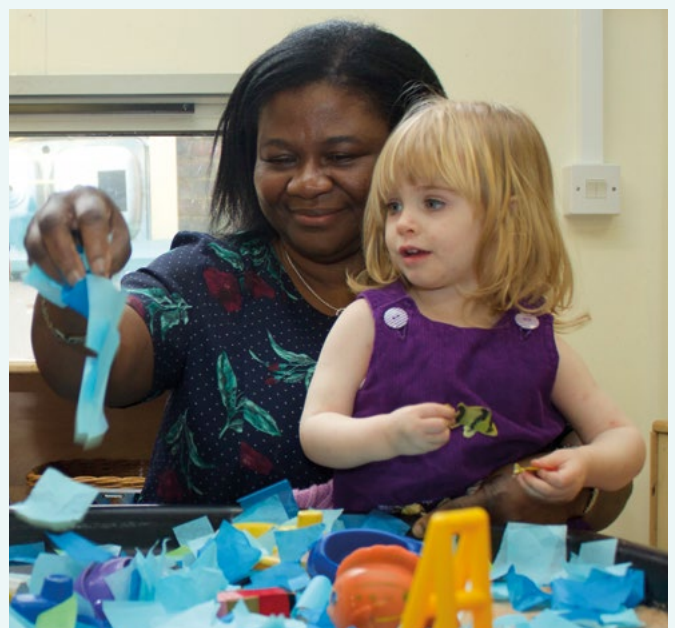
Example of LEYF nursery in similar building