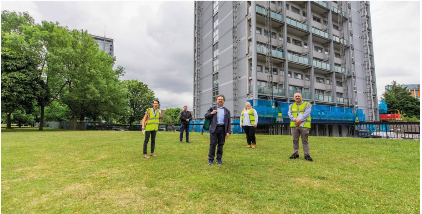
Council team visits fire safety works site at Warwick Estate