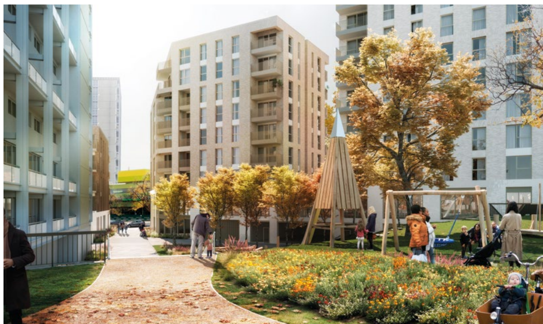
Artist's impression of 300 Harrow Road

BRINGING YOU THE LATEST FROM THE 300 HARROW ROAD DEVELOPMENT