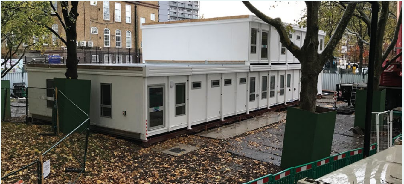
Progress on site at Westbourne Green

S ince July 2020 we have been working on a new temporary home for Harrow Road nursery to keep it running while their brand-new space is being built.