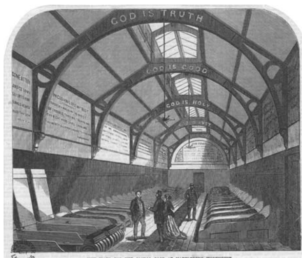
The new casual wards at St Marylebone Workhouse

The parishes entrusted the care of the poor to overseers or guardians of the poor . Their minutes and accounts contain some references to individual paupers.