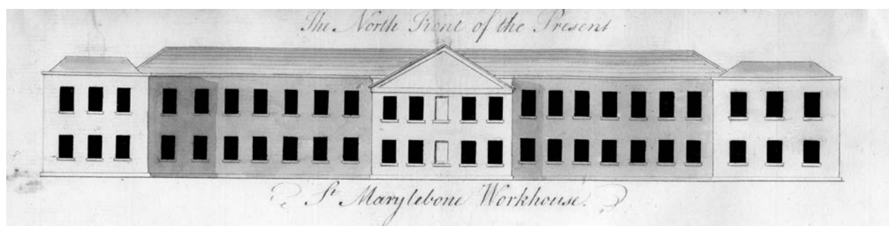
Elevation of the St Marylebone Workhouse