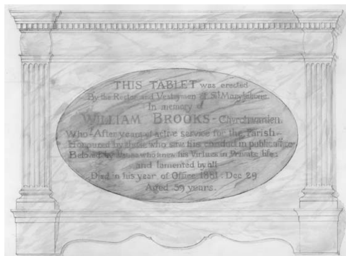
Watercolour of memorial tablet in St Marylebone church