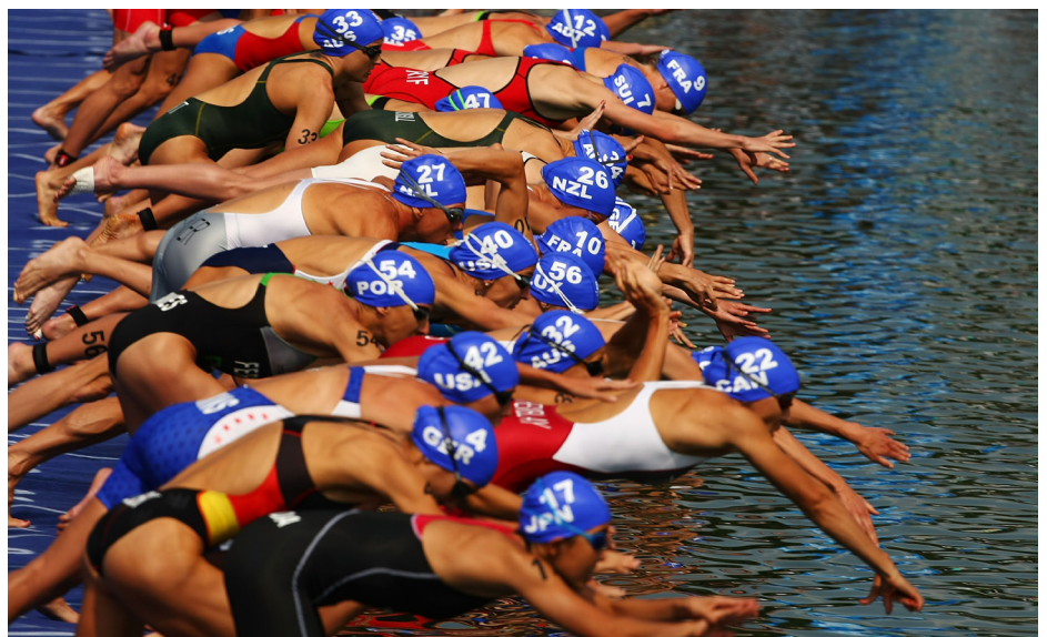
Olympic Triathlon swimming

LOCOG is working with The Royal Parks to minimise the impact to the park and its visitors. Information will continue to be available between now and 2012.