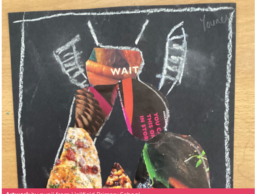
Artwork by pupil from Hallfield Primary School

reason, your application will be considered after all of those which were submitted on time. This will greatly affect your chances of being offered the school you want.